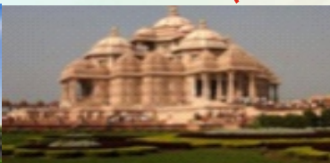
Akshardham 30 km