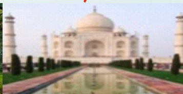
Taj Mahal 230 km