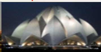
Lotus Temple 32 km