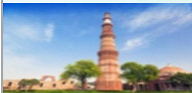
Qutub Minar 35 km