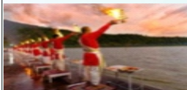
Rishikesh 180 km