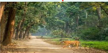
Jim Corbett National Park 185 km